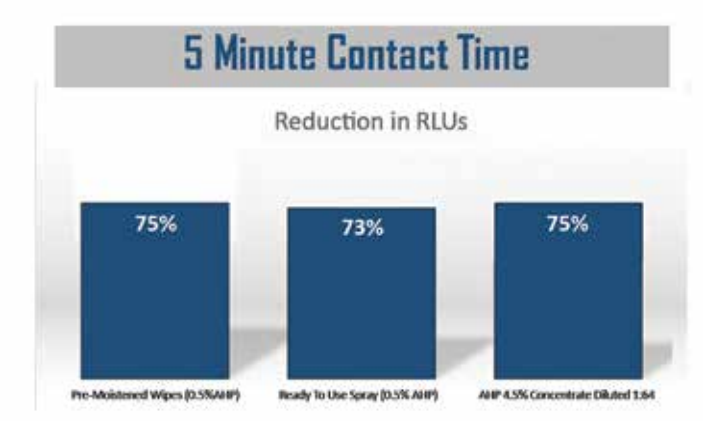
Figure 5. Five minute contact time.

timer was utilized. At the conclusion of the contact time, each tablet was wiped with a Kim wipe (Figure 1). Following the post-wipe procedure, ATP testing was repeated for a postdisinfection comparison (Figure 2).