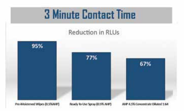
Figure 4. Three minute contact time.

It was concluded that the premoistened wipes were the most effective at reducing the biological residue on the tablets due to the entire surface area of the tablet being covered more uniformly than the spray method. We believe that the shorter contact times were most effective, regardless of the product, because the liquid was not allowed to dry completely. In other words, when any remaining liquid was spread over the surface with a Kim wipe at the end of the testing window, it acted like a premoistened wipe disinfecting the entire surface. The spray method, at the longer contact times, dried in particulates thus not covering the entire surface. Even though all three sanitation methods were effective at reducing the biological residue on the tablets, the premoistened wipes are the most convenient