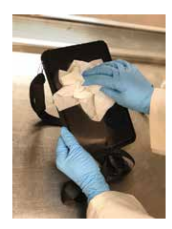
Figure 1. After the contact time, the device was wiped with a Kim wipe and then swabbed with an ATP swab.

The electronic tablets that are used inside the facility by the technical staff were collected. The devices were then divided into three groups, with three tablets in each group. One group was for premoistened wipes (0.5 % AHP), another for ready to use product (0.5% AHP), and another for diluted disinfectant (4.25% concentration diluted to a 1:64 ratio). Once the groups were established, they were then divided further based on contact time; 1 min, 3 min, and 5 min per tablet. Each device was ATP tested before cleaning for a baseline value. The device was either wiped down with one premoistened wipe or misted with one spray and allowed to sit for the specified contact time. To account for contact time for each of the three tablets within each group, a